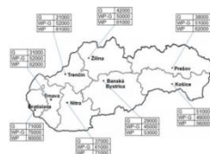
Figure: Supply and demand in the labour market by regions until 2023

The Slovak labour ministry offers data on trends in the labour market via the new portal . This new portal offers data at national and regional levels and with regard to individual occupations. The portal also presents new working posts created due to the economic growth. Read more here .