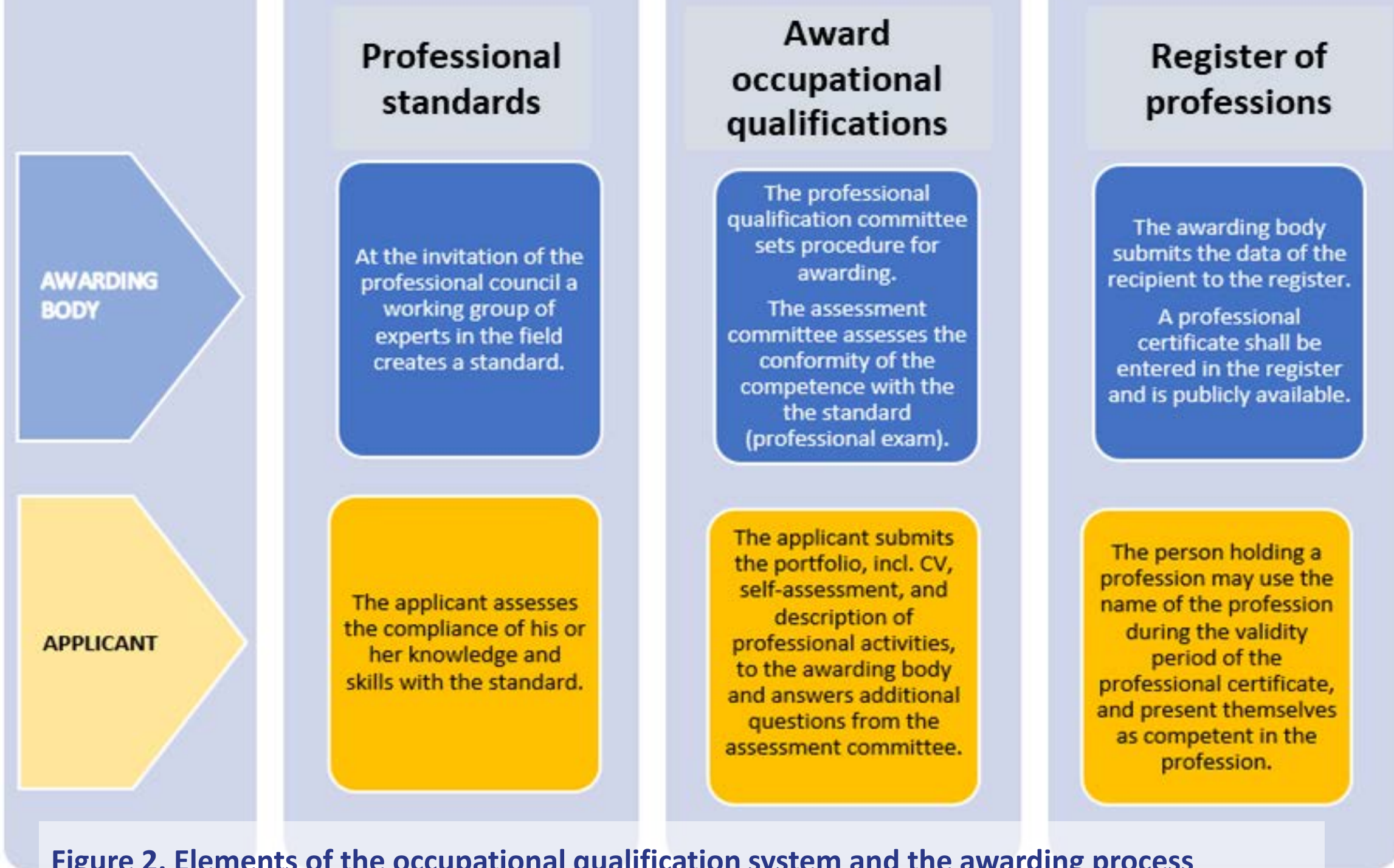
Figure 2. Elements of the occupational qualification system and the awarding process