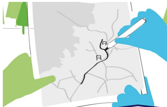
Single point of location