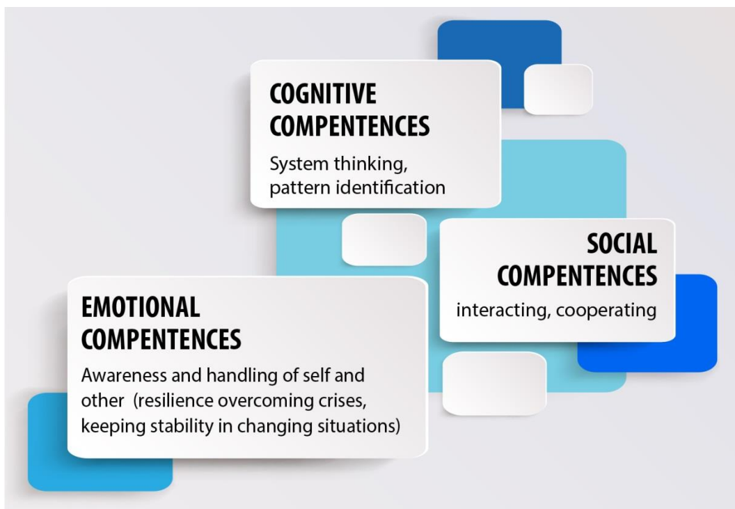
Figure 1. Personal agency infrastructure

Resilience can be seen as a crucial component of emotional competences, coming into play in difficult situations which require self-control based not only on accrued defences but also on a creative relationship with the external conditions. Resilience includes important social and cognitive traits, related to the abilities of maintaining both solidarity relations and sense-making regarding the contingencies of the context. It must be underlined that this kind of approach to competences has been successfully transplanted from its organisational (corporate) origins to much wider contexts, including education and guidance. The so-called life skills approach is, in fact, aimed at supporting initiatives for the development of self-reflection and the diffusion of pro-social behaviours (Senatore et al., 2010). Developing resilience as part of a strategy of wider emotional development could help heal some of the problems associated with low learning scarring.