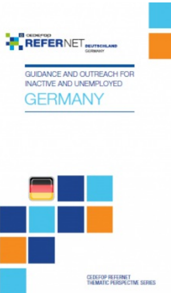
2018 Guidance and outreach for inactive and unemployed - Germany