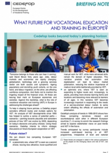
November 2018 Briefing note - What future for vocational education and training in Europe?