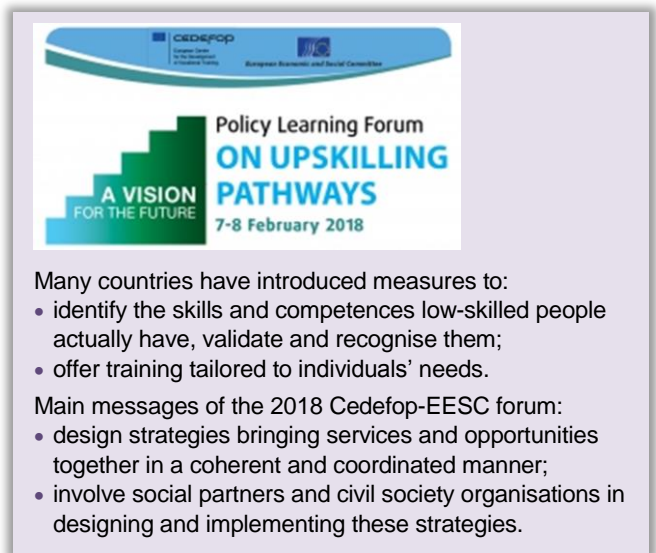
Box 1: UPSKILLING ADULTS: POLICY LEARNING FORUM OUTCOMES

A second event will be held in February 2019, again with the EESC. Cedefop will support the discussions with a draft analytical framework and quantitative information on low-skilled adults in the different countries – preliminary results of its ongoing project exploring the potential of work-based learning in helping upskill adults.