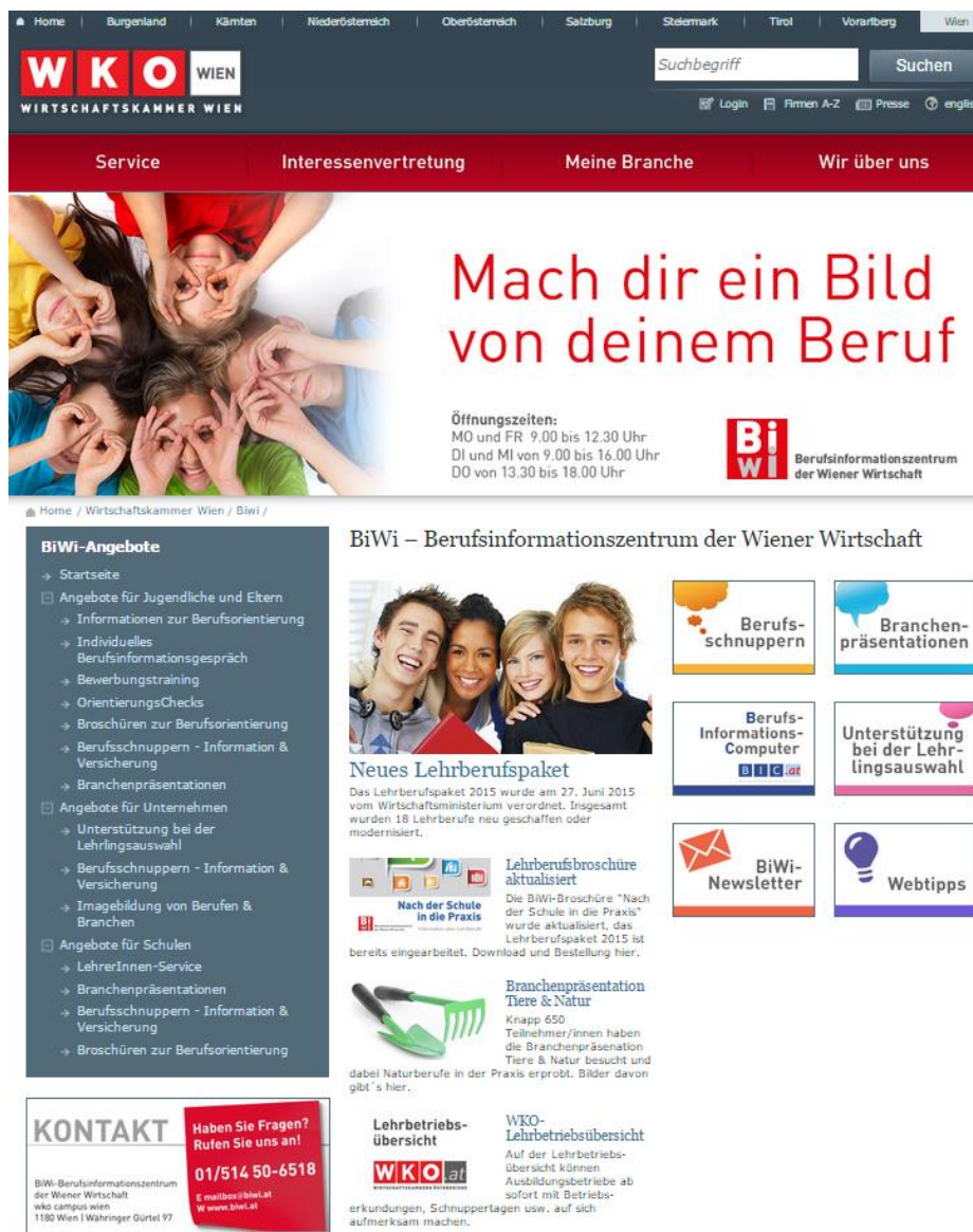
Figure 2: BiWi home page

(iii) Leverage the Industry Presentations offering of BiWi in order to better present their work and communicate their needs to young people, parents and teachers in practice.