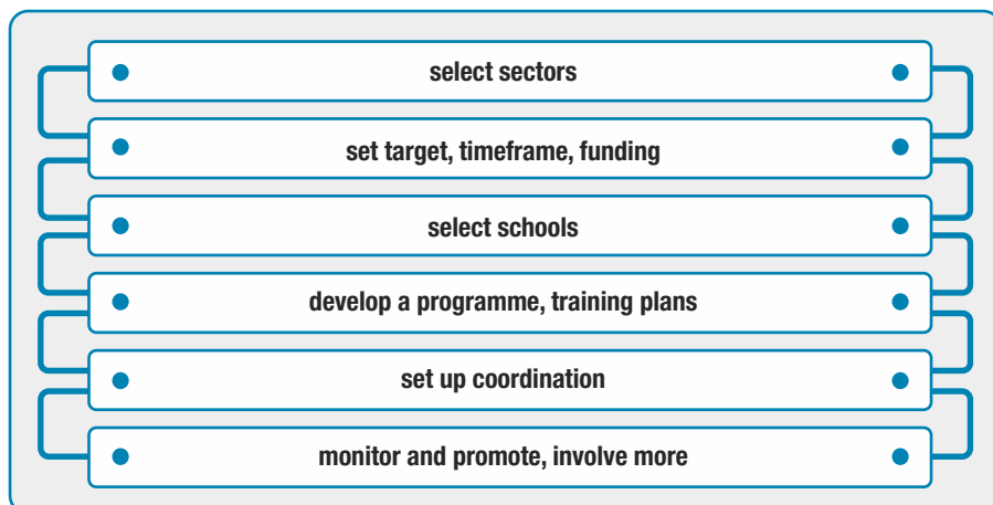
Figure 2. Starting small: a national apprenticeship project

The MES and social partners should closely monitor implementation of the small-scale project and use acquired experience to involve more employers and VET providers in providing apprenticeship programmes and to expand them to other sectors and occupations.